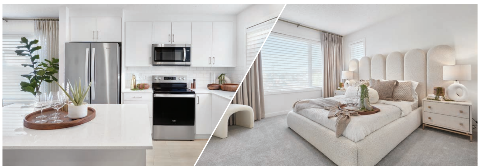
Renderings and images are representational only.

TO VIEW YOUR NEW DREAM HOME, CONTACT: Ana Popa | The Hills at Charlesworth 780.757.7632 | charlesworthfd@jayman.com | Jayman.com