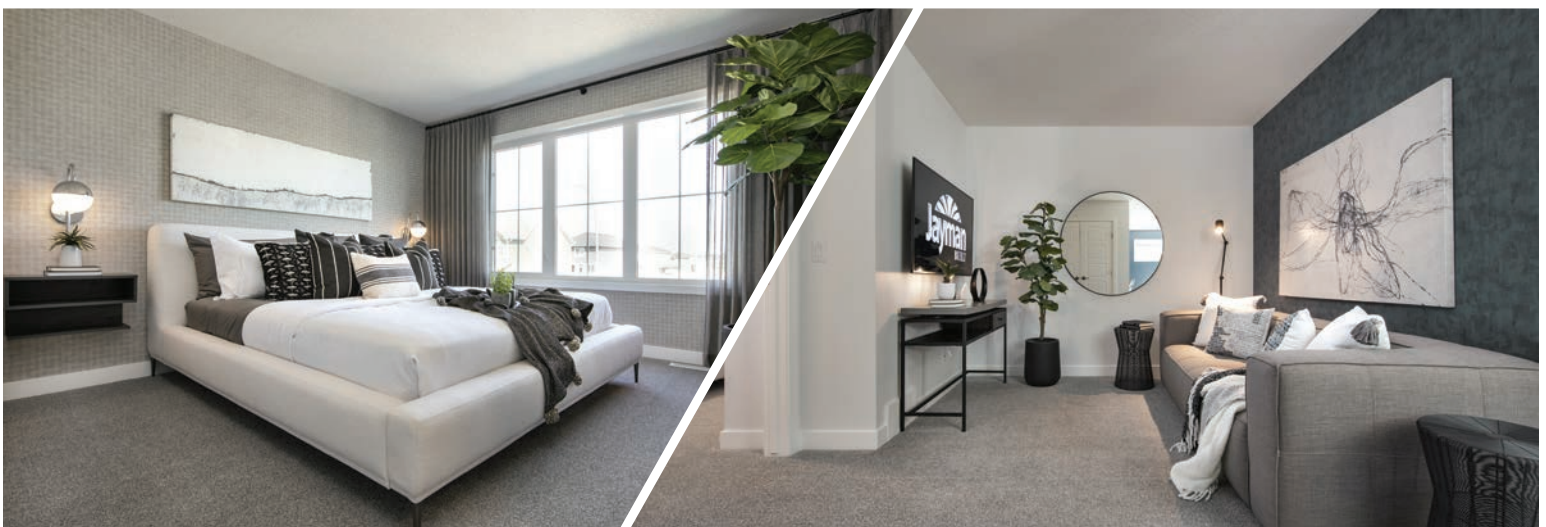
Renderings and images are representational only.