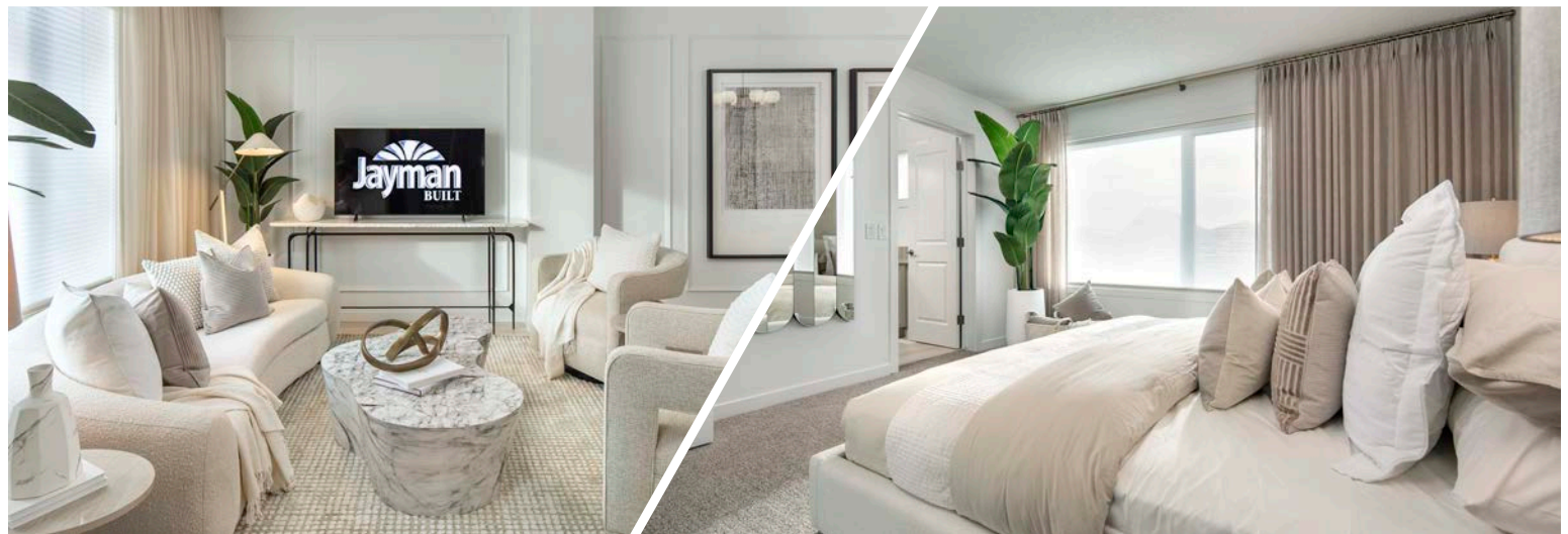
Renderings and images are representational only.