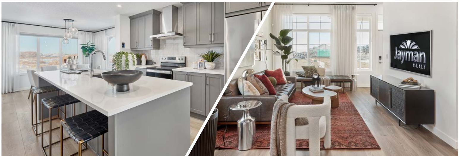
Renderings and images are representational only.