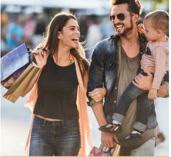
WALKING DISTANCE TO RETAIL SHOPS, RESTAURANTS, GROCERY STORE AND BECREATION FACILITIES

CALGARY'S PATHWAY SYSTEM CONNECTING TO CARBURN PARK AND FISH CREEK PARK